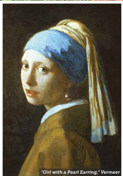
"Girl with a Pearl Earring," Vermeer