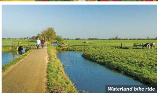
Waterland bike ride